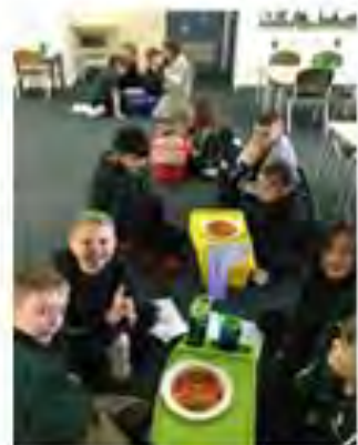
Using heat to dissolve skittles (physical change)

For the first 5 weeks in term 2 students have been looking at physical changes, learning and identifying what physical changes are and providing examples. Students developed their knowledge by participating in exciting experiments, where they also practiced making predictions.